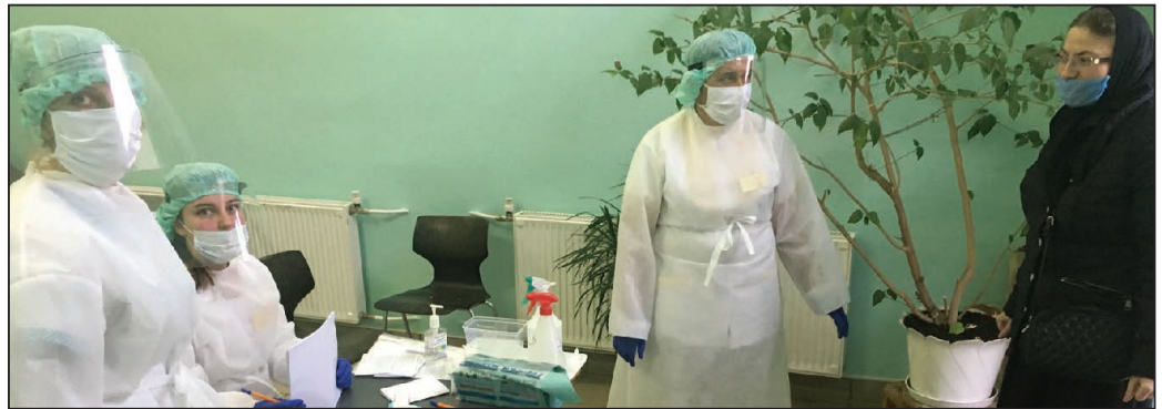
Christian Medical Center workers in Ukraine wear personal protective gear while welcoming patients.

You'll notice this issue of the GAP newsletter does not include a second page of ministry prayer requests. Many of the requests are similar to last month during this pandemic. We encourage you to continue using the document from last month's Day of Prayer and Fasting during the month of June. If you need a new copy please e-mail deb@lukesociety.org .